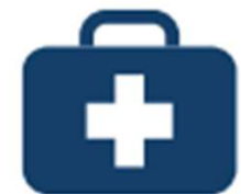
Finding Local Health Services