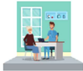
General support for practices